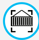
Container Identification Number

See the power of all the OCR Wedge configurations in action on your Zebra Android mobile devices, right out of the box, via the pre-installed DWDemo application.