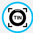
Tire Identification Number (TIN)