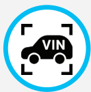
Vehicle Identification Number (VIN)